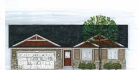
Pine II $239,400 1598 Sq. Ft.