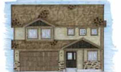
Cheyenne $259,900 1840 Sq. Ft.