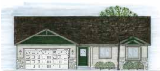
Maple $222,800 1427 Sq. Ft.