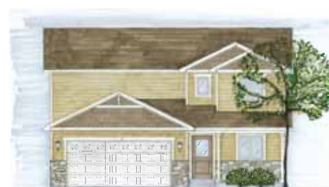
Spruce II $238,400 1621 Sq. Ft.