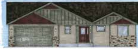
Bighorn I $257,800 1672 Sq. Ft. Bighorn II $262,900 1780 Sq. Ft.