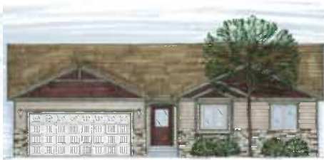
Cedar $217,100 1402 Sq. Ft.