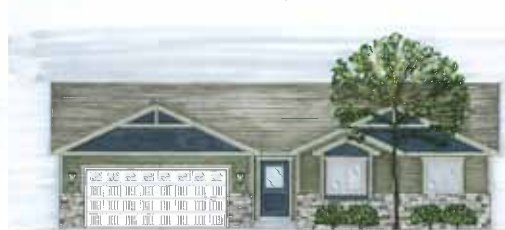
Pine I $229,900 1471 or 1473 Sq. Ft.