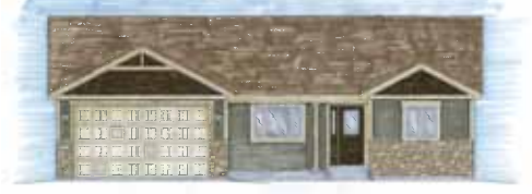
Wind River $224,900 1300 Sq. Ft.