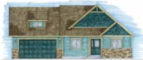
Yellowstone $256,600 1660 Sq. Ft.