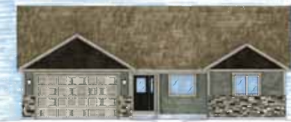
Green River $241,600 1478 Sq. Ft.