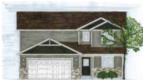
Spruce I $247,200 1801 Sq. Ft.