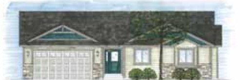
Powder River $252,400 1615 Sq. Ft.