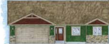
Sweetwater $247,500 1567 Sq. Ft.