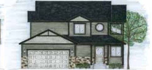
Cottonwood $255,300 1952 Sq. Ft.