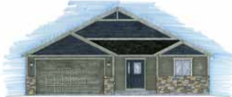
Medicine Bow $258,700 1713 Sq. Ft.