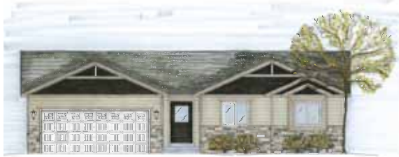
Birch $211,300 1239 Sq. Ft.