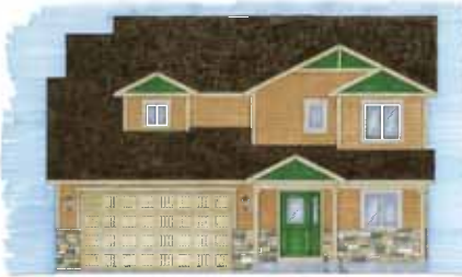
Madison $272,500 2066 Sq. Ft.